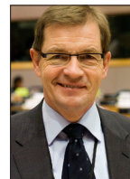
Bendt Bendtsen MEP

He studied business administration at the Business School of Reutlingen, in Germany.