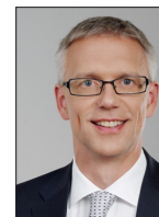
Krišjānis Kariņš MEP EPP, Latvia

He has degrees from Cambridge University and Oxford Polytechnic.