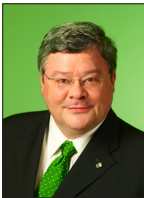
Reinhard Buetikofer Greens/EFA, Germany

He studied Business Administration and Economics at the University of Bayreuth.